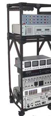
Shown with optional twin-wheel casters and cross braces