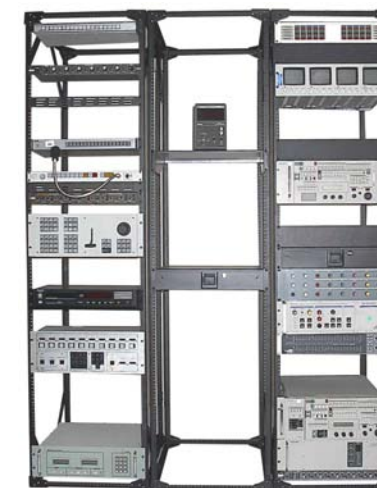
Shown with optional cross braces

(3) Screws Provided - Number of 10-32 x 5/8" rackmount screws & protective washers provided in Rail Set.