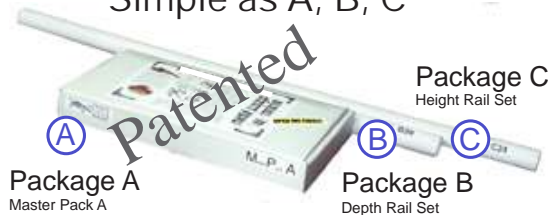
Package A Master Pack A