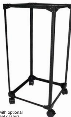
Shown with optional twin-wheel casters