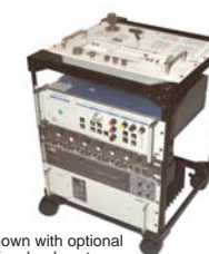
Shown with optional twin-wheel casters