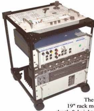
The "CUBE" - 19" rack mount width, depth & height, with front, rear, left, right, top & bottom access to 576 tapped 10-32 holes for racking 19" width rack mountable equipment.

3 precisely engineered parts when connected together form Wiggle-Free equivalent strength and integrity of fully assembled welded rack enclosures.