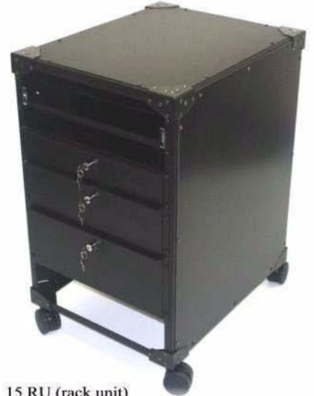
15 RU (rack unit) Rack with optional wheels, drawers, keyboard shelf, pvc side panels and steel top cover creates a lightweight, versatile and portable rack.