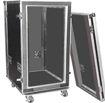
Rack Shown -Stock Model Quick Ship OEMRACF4X26X30

Rack rails permanently attached to inner rack shell that is embedded in a 2" foam lined outer case. Foam blocking beneath this inner rack shell is of a high density polyethylene to provide added support and cushioning when rack is operational in upright position. Rack lids have high density polyethylene foam blocking to cushion any transit movement of inner rack shell. F4 style shockmount racks are available in Quick Ship stock sizes; 16RU or 24RU x 24" rackable depth and 20RU or 26RU x 30" rackable depth. All custom sizes also available.