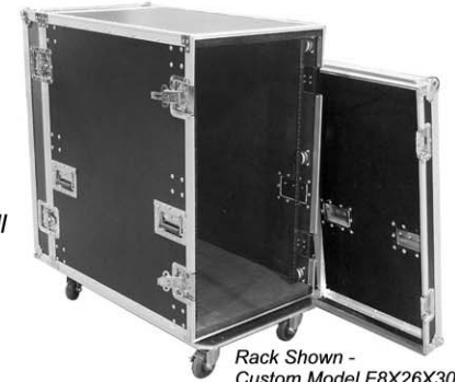
Rack Shown - Custom Model F8X26X30

Rack rails permanently attached to outer case by use of cup-mount shock isolating elastomeric isolators that help defend against hi-impact shocks and vibration. Each shock isolator has a maximum stationary load rating of 40 lbs. The number of shock isolators used will be calculated based on the total payload of your rack. F8 style shockmount racks are available strictly on a CUSTOM basis.